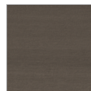
Coastal Grey Standard