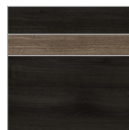
Ebony/ Timber Premium