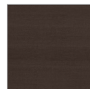
Woodland Brown Standard