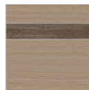
Aspen/ Timber Premium