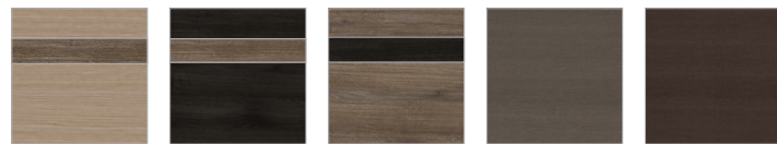
Aspen/ Timber Premium